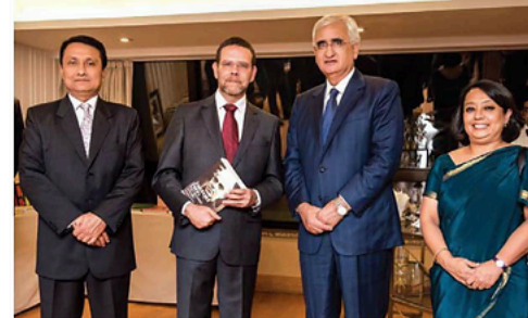
India in Brazil Snapshots of Bilateral Cooperation Activities in Brazil during Oct 2013-April 2014